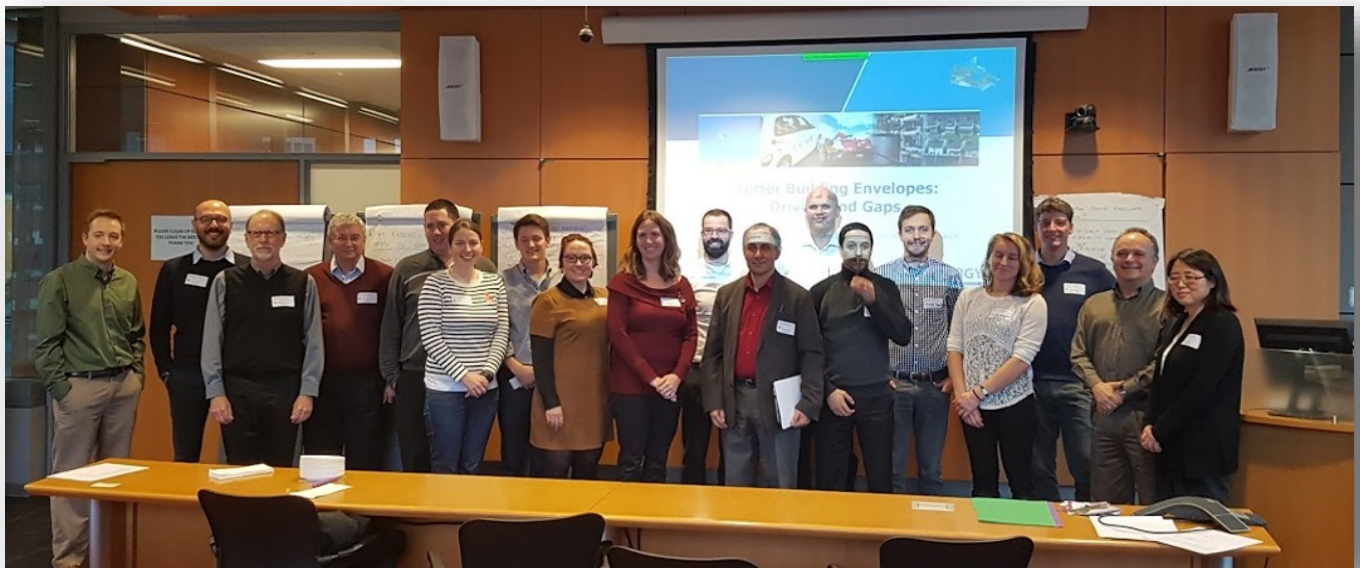
Participants at the Building Envelope Workshop held at Concordia University, December 2016