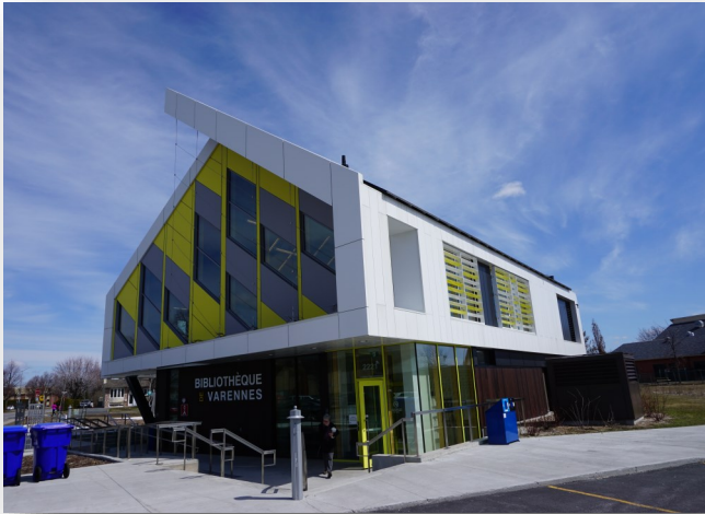
Varennes Library Exterior