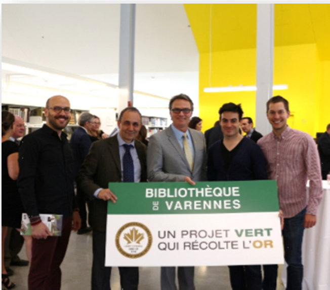
Varennes Library Inauguration