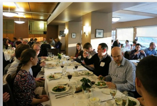
Most HQPs (left) attending the AGM presented papers at the eSim Conference. AGM Network Dinner (right), McMaster University.