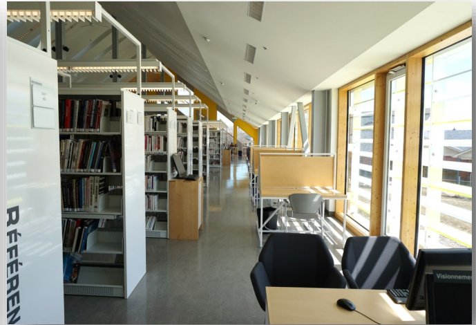
Varennes Library Interior